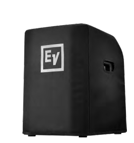
SUB COVER Sold separately