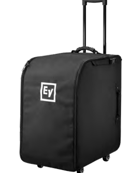
ROLLING SUB CASE